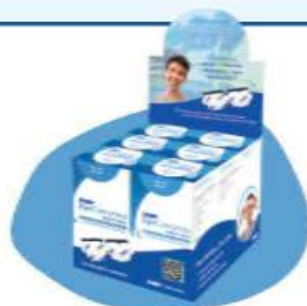
NEW COUNTER DISPLAY and RETAIL PACKAGE