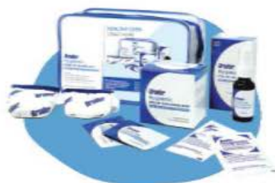
BRUDER LID HYGIENE PRODUCTS

Visit bruder.com/pro or email eyes@bruder.com